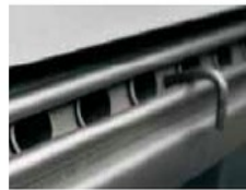
Heat Exchange Tubes (Standard)