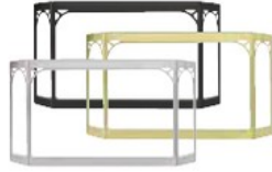
Painted Black, 24 Karat Gold Plated and Satin Chrome Plated Finishes