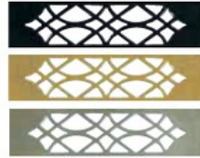
Trivets Painted Black (standard), 24 Karat Gold Plated and Satin Chrome Plated Finishes