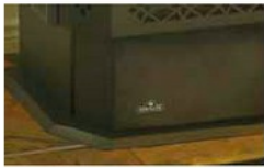
Ash Pan Door and Extra Large Door Finishes Ash Pan (Standard)