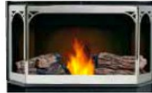
PHAZER® Decorative Ceramic Log Set