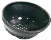
Cast Iron Burn Pot (Standard)